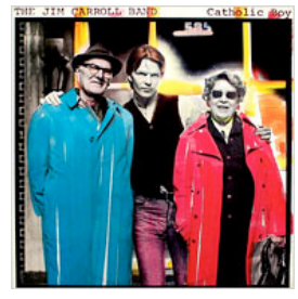
The "Catholic Boy" album cover.