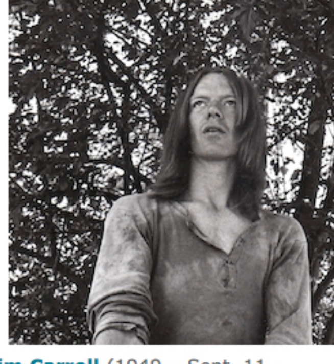
Jim Carroll (1949 - Sept. 11, 2009), author of the book/film, The Basketball Diaries, as I knew him—poet, friend: Bolinas, California,