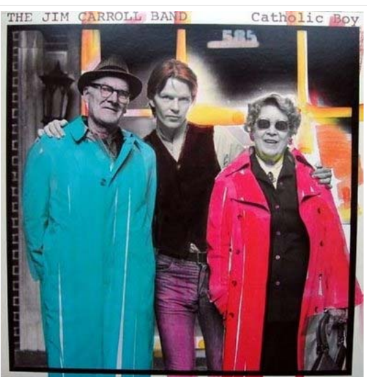
Jim Carroll's 1980 album, Catholic Boy.

Musician and poet Jim Carroll , best known for his song People Who Died and his 1978 autobiographical book The Basketball Diaries , died while working at his desk in his Manhattan home on Friday, September 11. According to The New York Times , the 60-year-old artist died of a heart attack.